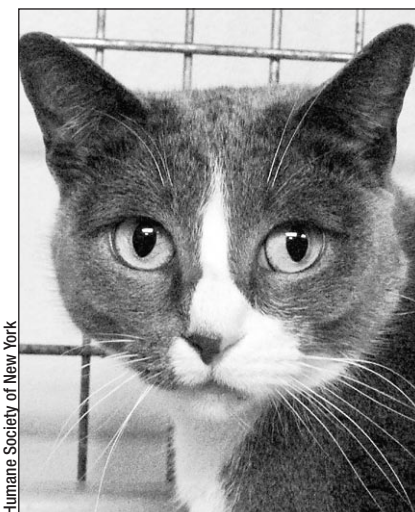
Humane Society of New York

Melanie is a beautiful, 2-year-old spayed kitty who's sweet and charming. What more can you want? Meet her from 11 a.m. to 4 p.m. at the Humane Society of New York, 306 E. 59th St.; 212-752-4840 or visit humanesocietyny.org .