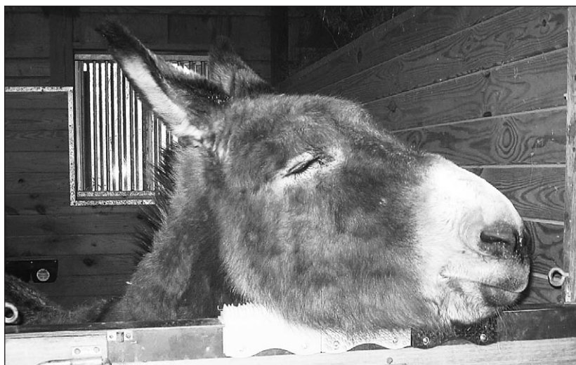
ASS BLISSING: Teddy the donkey gives himself a rubdown with the Scratch n All.